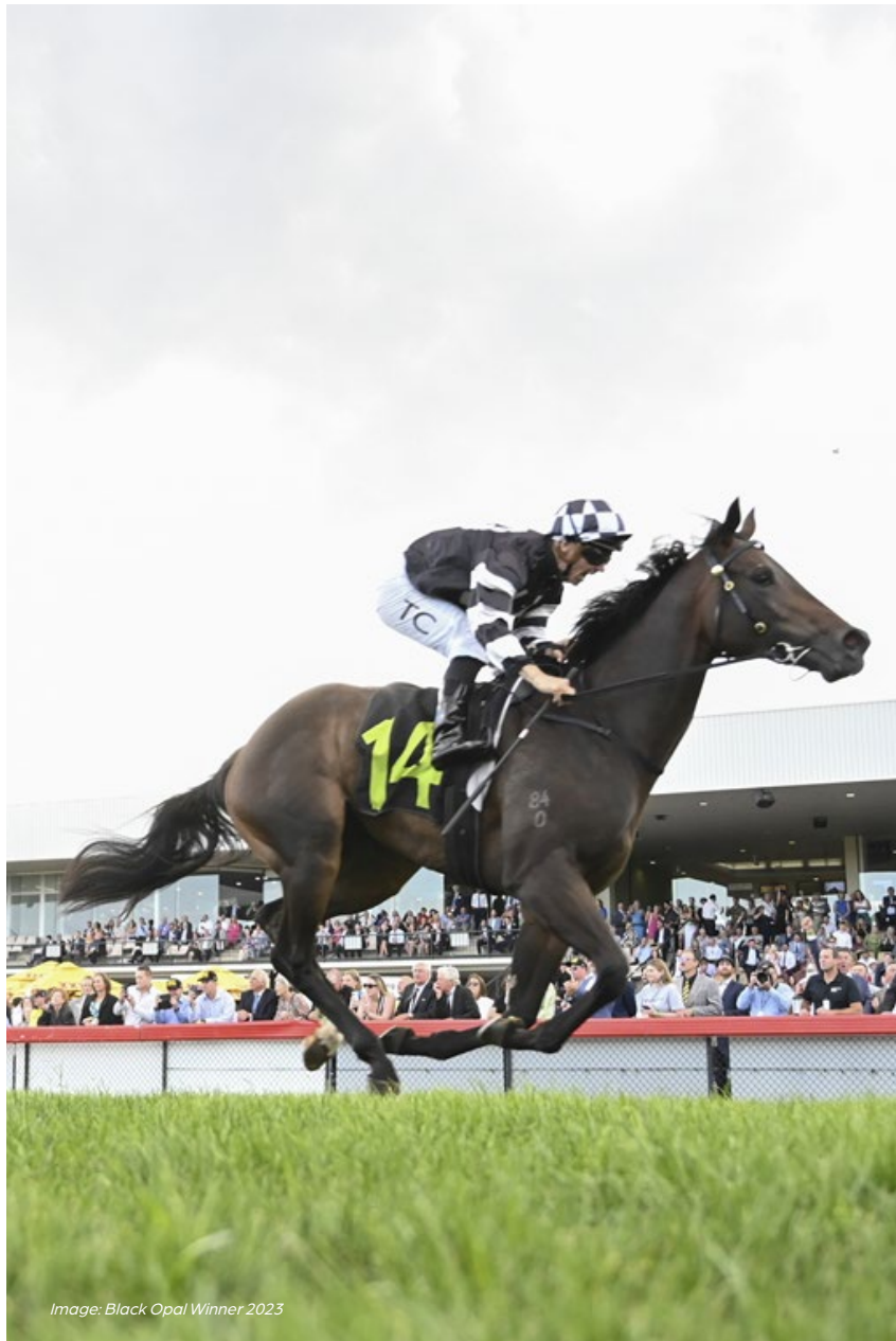
Image: Black Opal Winner 2023